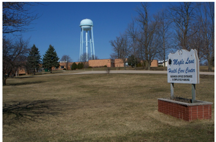
Maple Lane Health Care Center, a Belle Plaine landmark, will be sold by Shawano County, effective April 30.